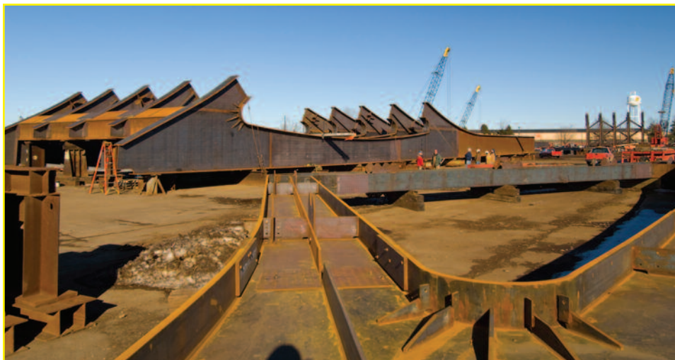
Stage 1 setup, foreground, and Stage 2 setup, background

High Steel's yard and setup team has played a major role in this project because of its size, the aggressive schedule, and the requirement for full set-up and reaming. Setup is especially complex for the over 40'-deep rigid frame delta-leg girder assemblies at the beginning of the arch span. Because these assemblies exceed the height at which complete vertical