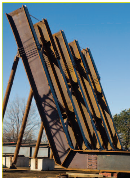
Stage 3 setup

for updates on this project in future issues of the High Steel News.