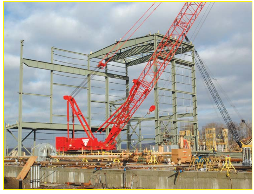
Kleen Energy plant under construction

looking at High Steel for other projects that are planned for coming months.